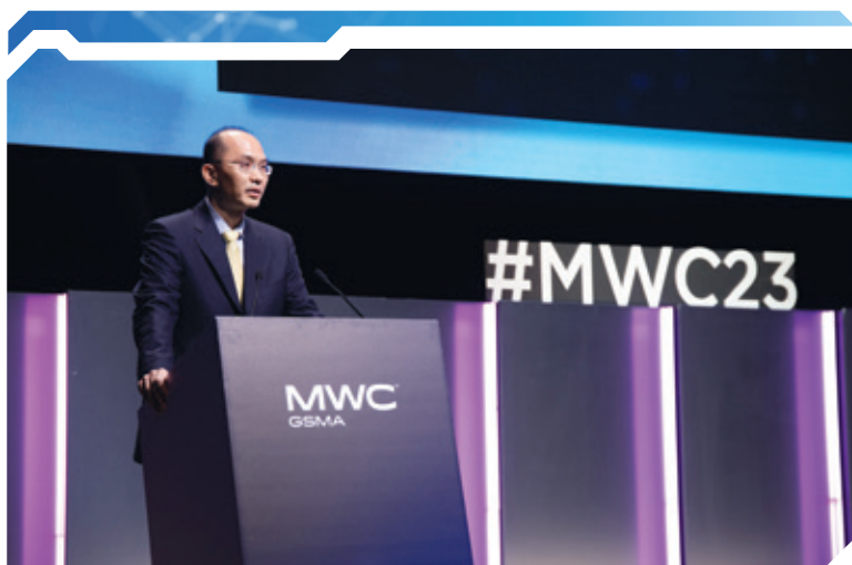
Management presented at Mobile World Congress (MWC)

Firstly, the nation proactively cultivates and develops new productive forces. Focusing on the building of Digital China and the development of new industrialisation, the nation has intensively introduced a series of new policies and new requirements, such as the release of the Overall Layout Plan for the Construction of Digital China , the introduction of the Action Plan for the High-quality Development of Computing Infrastructure and the Three-year Action Plan for "Data Elements×" (2024–2026) , etc., with an aim to vigorously promote the building of modern industrial systems, actively cultivate emerging industries and future industries, and further promote the innovative development of digital economy. In particular, the nation proactively builds new growth