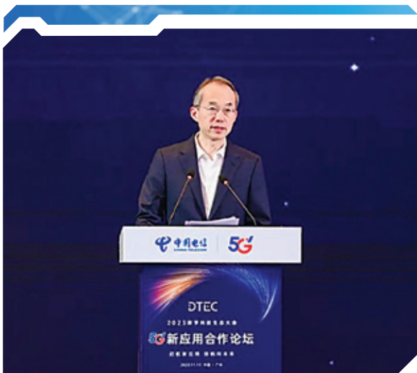
Management introduced China Telecom's new 5G applications